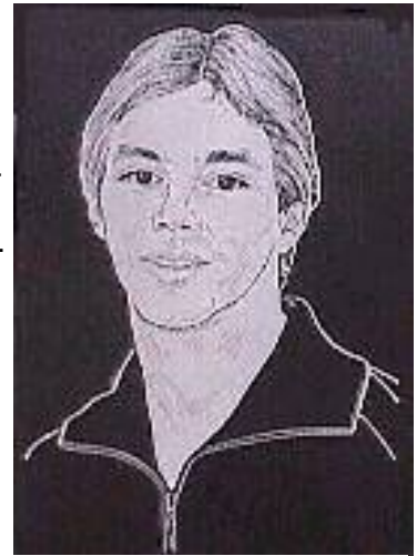
Gymnast Kurt Thomas