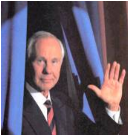
Former Tonight Show host Johnny Carson