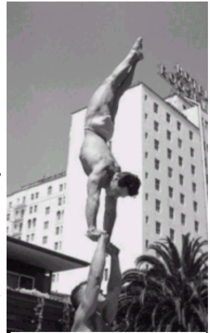
Fitness guru Jack LaLane hand balancing