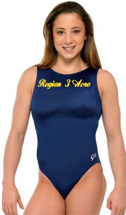
The illustration is not the actual leotard. The leo is red lycra. The logo will be embroidered on the front.

GK has two sizes. The “Sleek Fit” is a tight fit. The “Growing Room” is slightly baggy for more growing room. Determine the size according to the chart below, fill out the form on the next page and send one check per school payable to “Trevino’s Gymnastics” and indicate on memo line, “R3 Acro leotard order”. Be sure your order is correct. There will be no refunds.